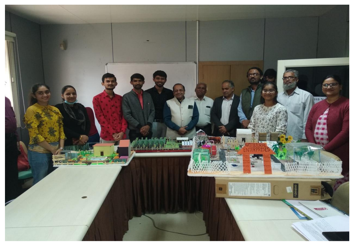
A Model Development Competition on "Integrated Agricultural Enterprises" organized by the WTO Cell, Department of Agricultural Economics, B. A. College of Agriculture, Anand Agricultural University, Anand on 24<sup>th</sup> December, 2021.

A two days national seminar on "Prospects of Livestock and Dairy in India under changing Global Economic Era" was organized by the WTO Cell, Department of Agricultural Economics and Department of Animal Science, B. A. College of Agriculture, Anand Agricultural University, Anand on 17th and 18th January 2013.